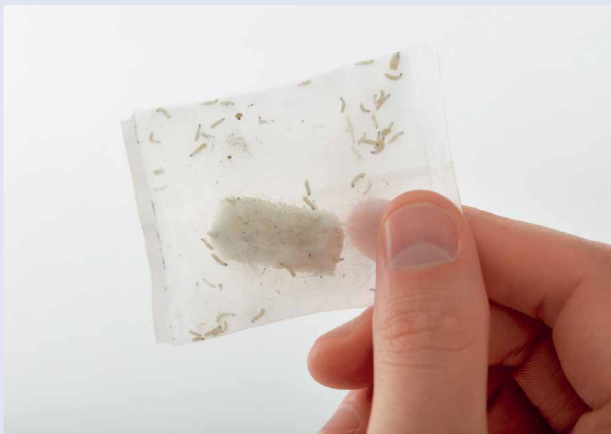
3a. BioBag pre-application