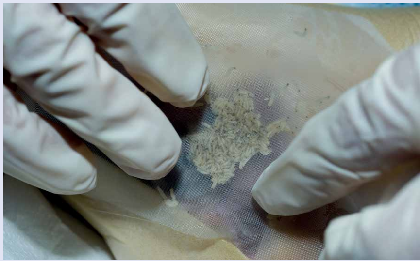
Fig 2. Application of free-range maggots onto a wound

“Recently, there has been particular interest in understanding and identifying the therapeutic antimicrobial properties of maggot secretions”