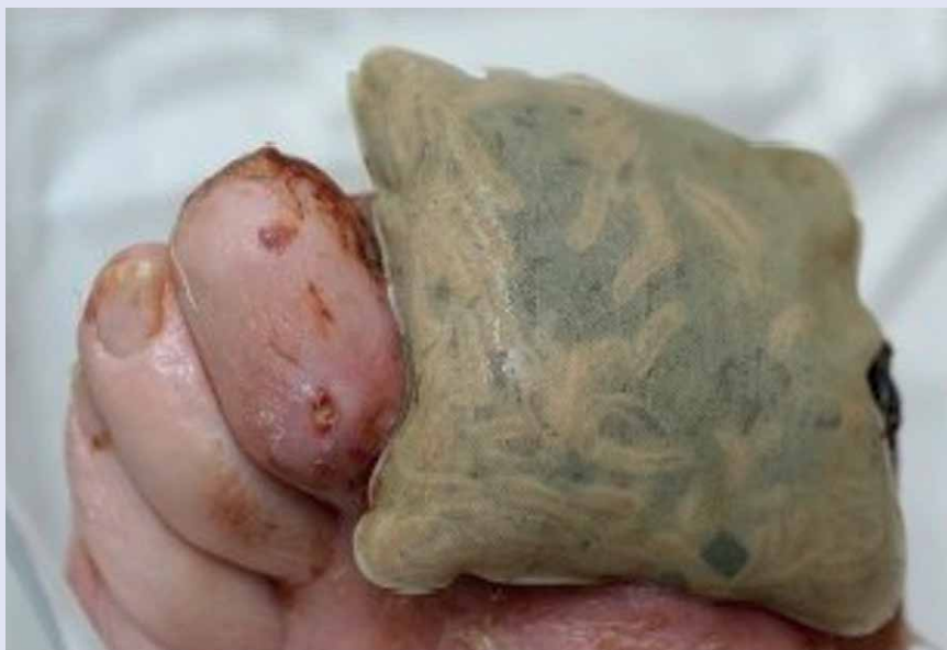
3b. Maggot bag after three days' application

2009b). For patients with a chronic wound, the offer of maggot therapy is often their final hope, but Steenvoorde et al (2005) found a high number of patients are subject to adverse social interactions while undertaking it. This consisted mainly of other people finding the idea of maggot therapy “eerie”. The authors suggested: